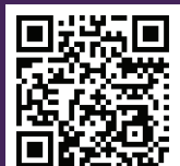
QUICK GIVING QR CODE FOR SMARTPHONES